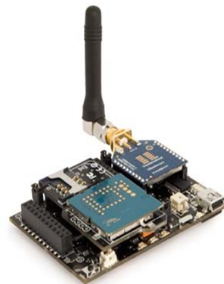
Fig: 1 Wasp mote Sensor Device