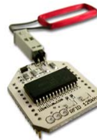
Fig: 4 Waspote RFID module

For the detection of expiry food or to alert a client about no consumable food waspmote RFID module can be used. RFID (Radio Frequency Identification) is a technology used for the identification of objects in contactless way with use of electromagnetic fields, also known as proximity identification [8] .